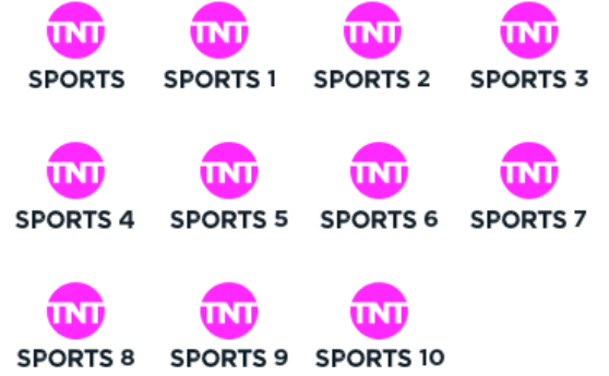
TNT SPORT LOGO & CHANNEL S 1-10 STACKED ON LIGHT BACKGR OUNDS